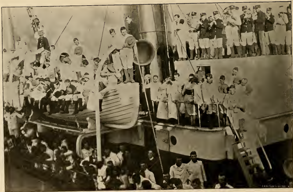
KANSAS SOLDIERS ON BOARD TRANSPORT, BOUND FOR MANILA.